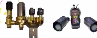
Electrovalves on/off with sonar