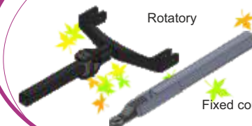
Fixed coupling with ring