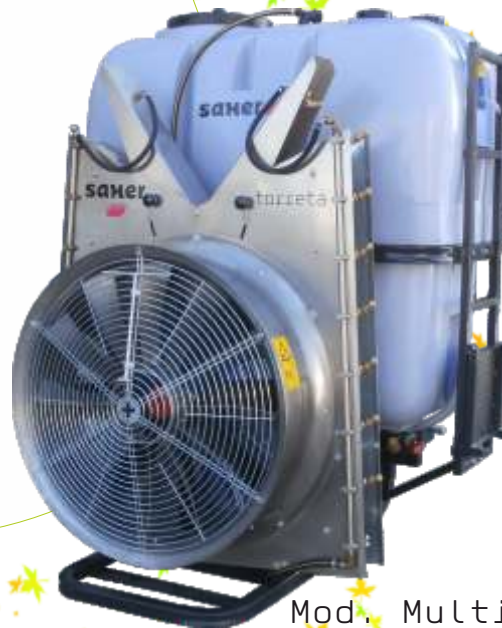
Mod. Multiplier fan unit Torreta