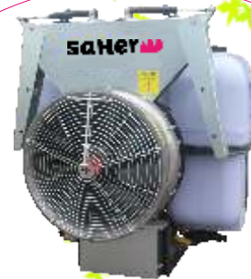
Mod. Fan unit belt with ailerons