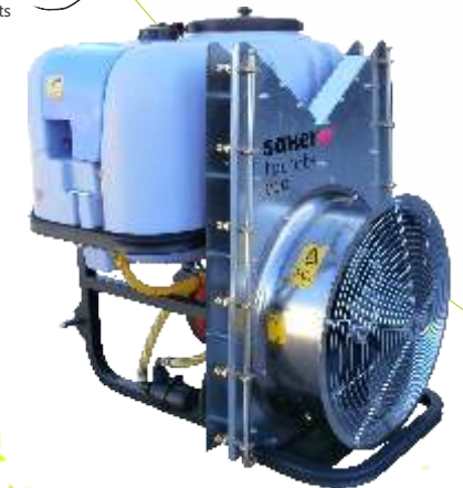
Mod. Multiplier fan unit Torreta ECO