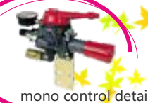
mono control detail