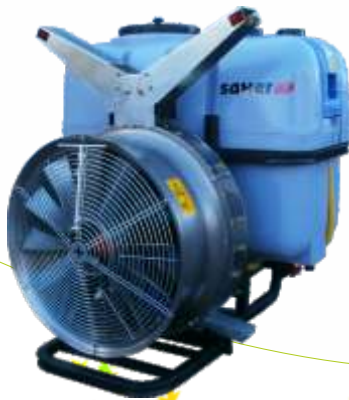
Mod. Multiplier fan unit with V ailerons