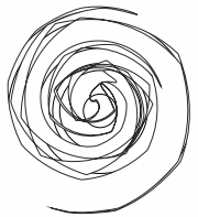
Mod. Fan unit belt